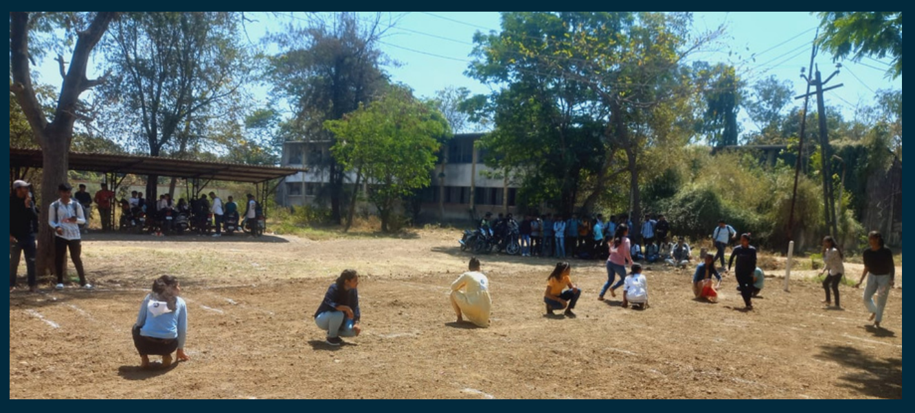
SPORTS WEEK ( 04/03/202024 TO 07/04/2024 )

UDAAN 2024 SPORTS FESTIVAL WAS ORGANIZED IN THE INSTITUTE FROM 04/03/2024 TO 07/03/2024. IN WHICH THE STUDENTS OF THE CIVIL DEPARTMENT PARTICIPATED ENTHUSIASTICALLY, IN WHICH THE COMBINED TEAM OF SECOND SEMESTER CIVIL AND IT STUDENTS WON THE FINAL KHO-KHO.