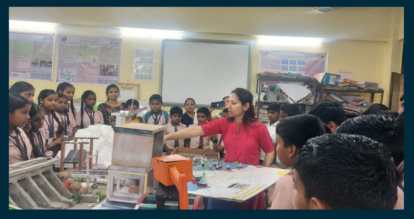
AMBHETI SCHOOL'S STUDENTS VISIT IN OUR CAMPUS (06/03/2024)

DATE: 06/03/2024 , PRIMARY SCHOOL STUDENTS OF AMBHETI ,KAPRADA TALUKA CAME FOR AN EDUCATIONAL VISIT TO THE INSTITUTE, STUDENTS VISITED VARIOUS DEPARTMENTS OF THE INSTITUTE, IN WHICH THE STUDENTS WERE BRIEFED ABOUT CIVIL ENGINEERING BY THE HEAD OF DEPARTMENT DR. N.C. PANDYA.THE STUDENTS OBSERVED THE PROJECT MODEL PLACED IN THE PROJECT ROOM.