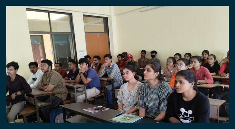
CAREER GUIDANCE SEMINAR 21/03/2024